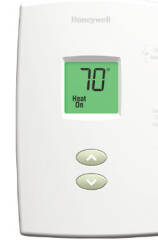
PRO 1000 Vertical Non-Programmable