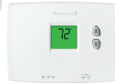
PRO 1000 Horizontal Non-Programmable