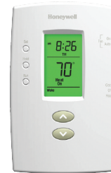
PRO 2000 Vertical Programmable